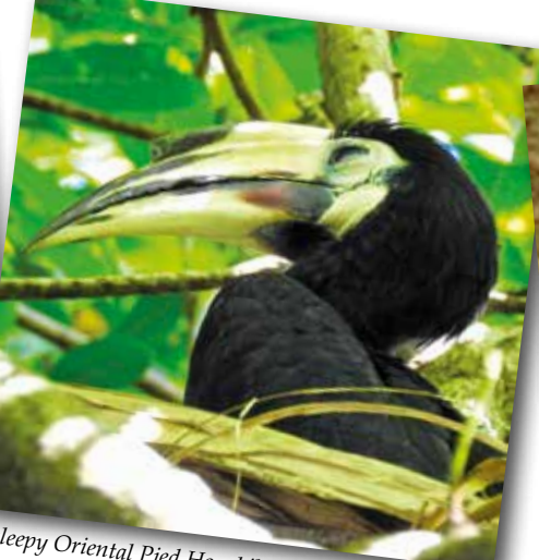
A sleepy Oriental Pied Hornbill dozes off in the foliage