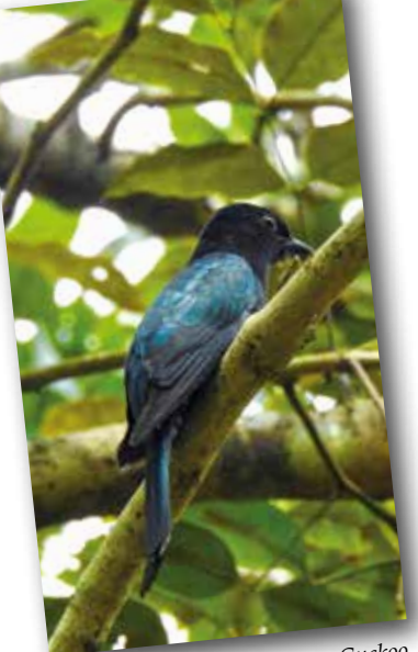
The Square-tailed Drongo-Cuckoo is a species of cuckoo that closely resembles the drongo

Singapore, despite its glitzy urban appearance, is home to an incredible array of wildlife. The island's rich biodiversity can be observed in the four nature reserves as well as the numerous parks across the city.