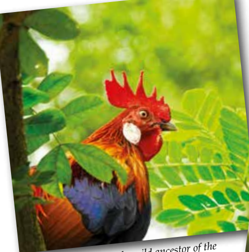
The Red Junglefowl is the wild ancestor of the domesticated chicken