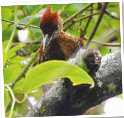
A Banded Woodpecker ( Chrysophlegma miniaceum ) busy at work in the reserve. This medium-sized woodpecker is identifiable by its distinctive crest, red wings and upper body.