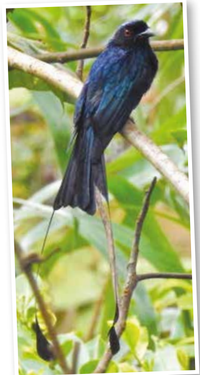
Greater Racket-tailed Drongo ( Dicrurus paradiseus ) spotted in the Bukit Timah Nature Reserve. This bird is identifiable by its long, racket-shaped outer tail feathers.