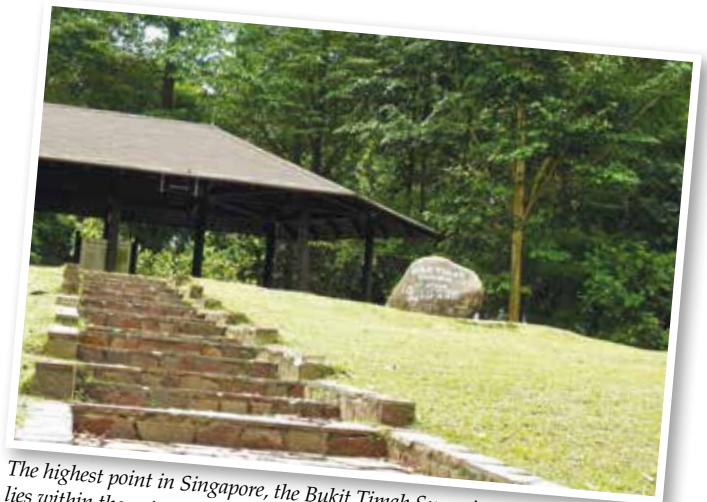
The highest point in Singapore, the Bukit Timah Summit (163.63 metres), lies within the nature reserve