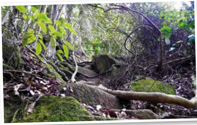
The Rock Path is a hiker's delight