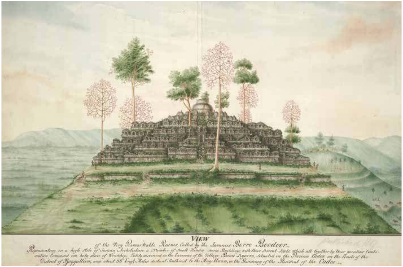
General view of the temple at Borobudur, circa CE 1814, watercolour on paper, Sir Thomas Stamford Raffles collection

The much-awaited Treasures of the World exhibition opened at the National Museum of Singapore on 5 December to enthusiastic crowds. It is the first time that this touring