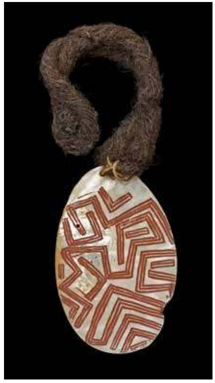
Pearl shell ornament, Kimberley, Western Australia, early to mid-19th century CE

The treasures of this exhibition are not limited to gold and silver artefacts. Another prized artefact is the pearl